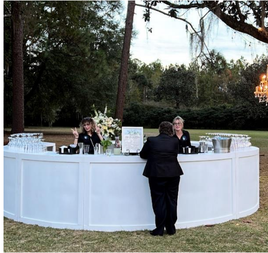
Large Circular - $950