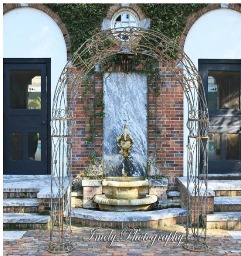
Cast Iron Arch $250