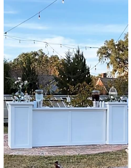
8ft. Straight with pedestal sides - $450.00 per (4 sets available)