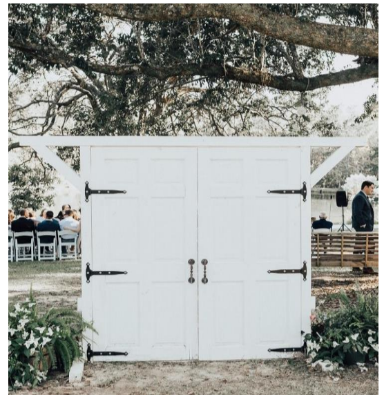
Ceremony Doors $550