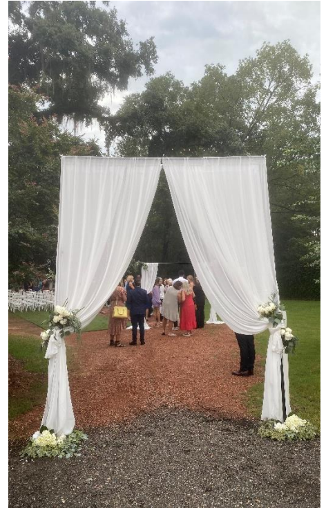
Ceremony Curtains $250 per set (Photo shows 1 set)