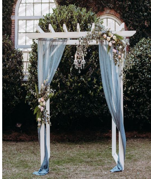
White Pergola w/hanging chandelier $350 (Draping not included)