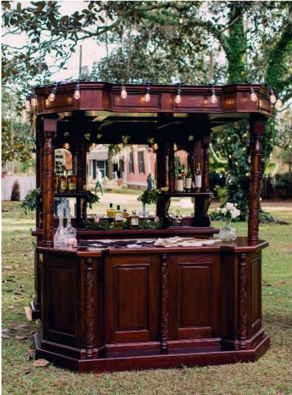
Antique - $2,400.00

Bar rental pricing does not include increase in event staff fee for bartender operations during event.