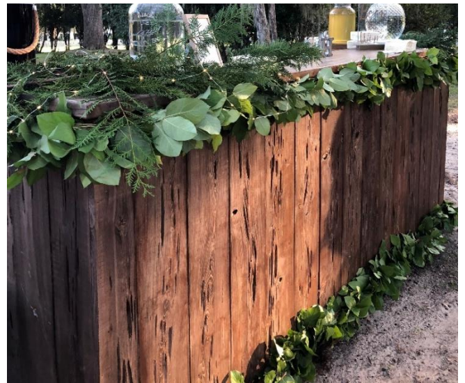
8ft. Pecky Cypress Wood - $450