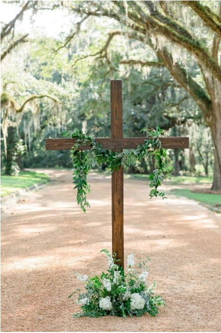
Ceremony Cross $185