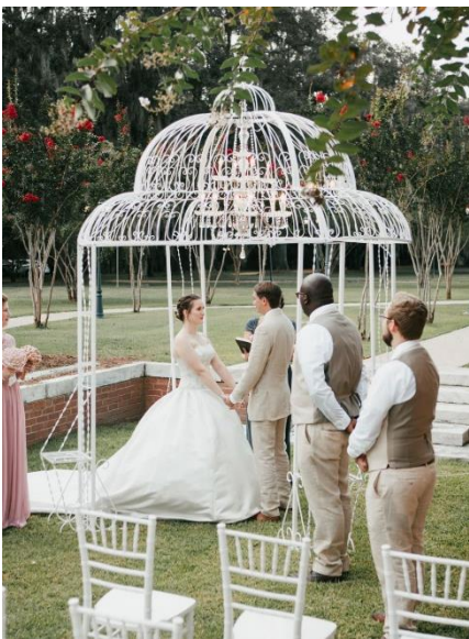
White Gazebo w/hanging chandelier $350