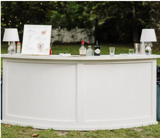
6ft. Curved - $325